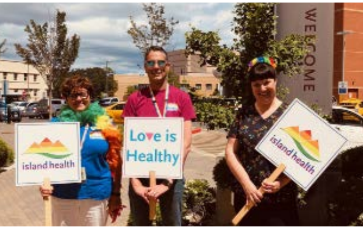
Island Health staff celebrating Pride Week